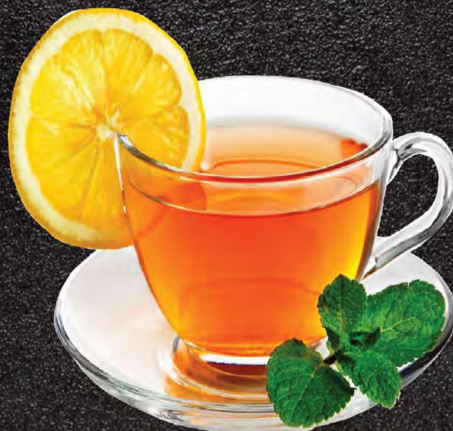
Tea O Lemon

All Pictures shown are for illustration purpose only