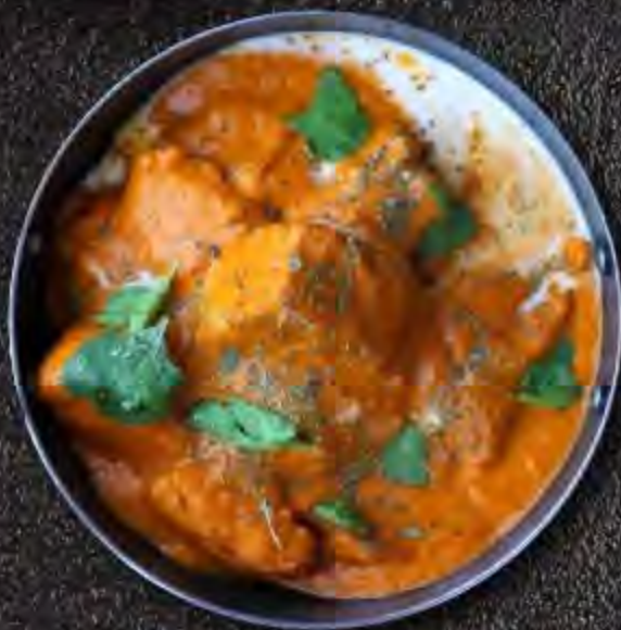
Mock Butter Chicken