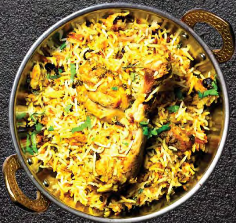
Kadai Chicken Biryani