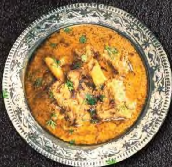
Mock Mutton Korma