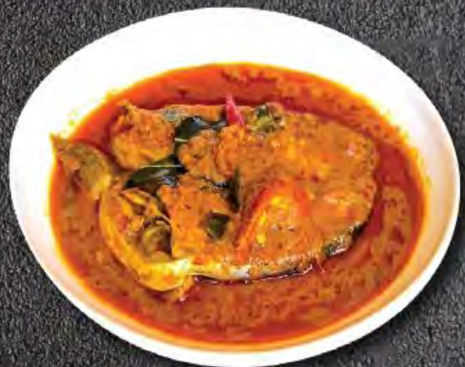
Mock Fish Curry

10 % Service Charge Applicable + Tax for Dining