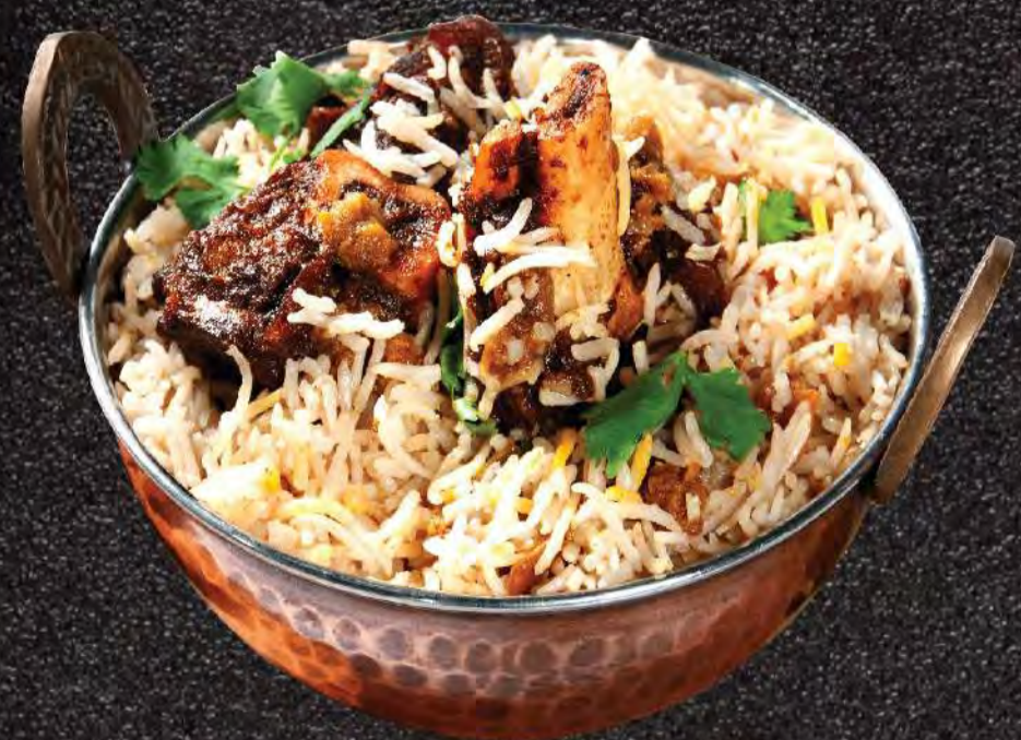
Lamb Shank Biryani

All Pictures shown are for illustration purpose only