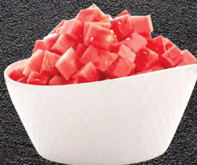
Watermelon Cut Fruit