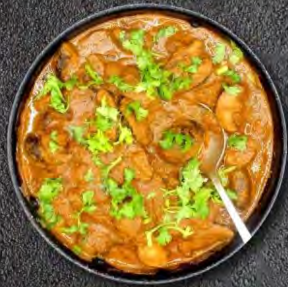
Mock Mutton Curry

10 % Service Charge applicable + Tax for Dining