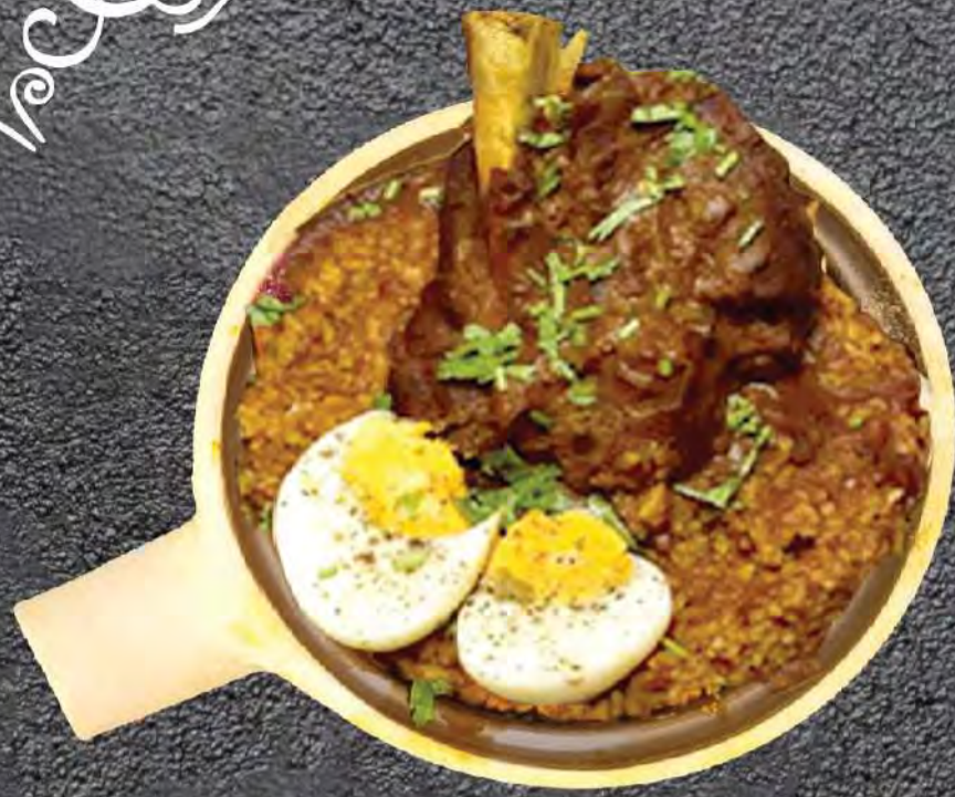
Lamb Shank Satti Sorru

All Pictures shown are for illustration purpose only