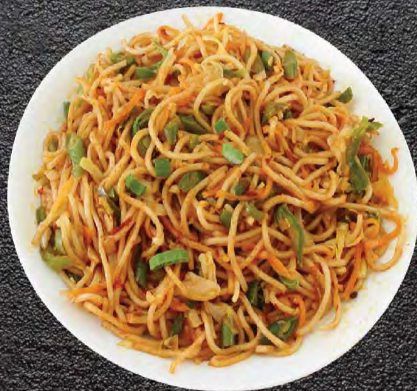
Schezwan Hakka Noodles