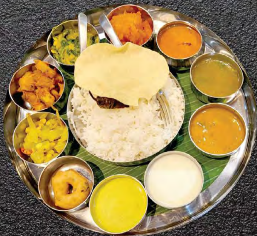
Veg - Meals (South Indian)