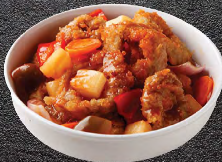
Sweet & Sour Sotong