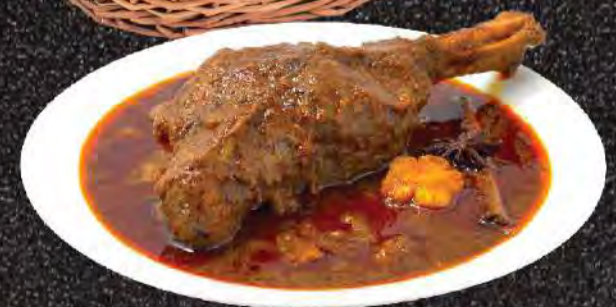
Lamb Shank Chettinad with Plain Naan

All Pictures shown are for illustration purpose only