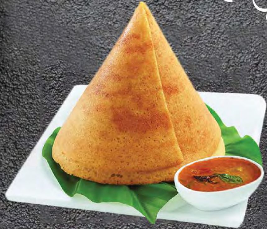
Plain Dosa Set