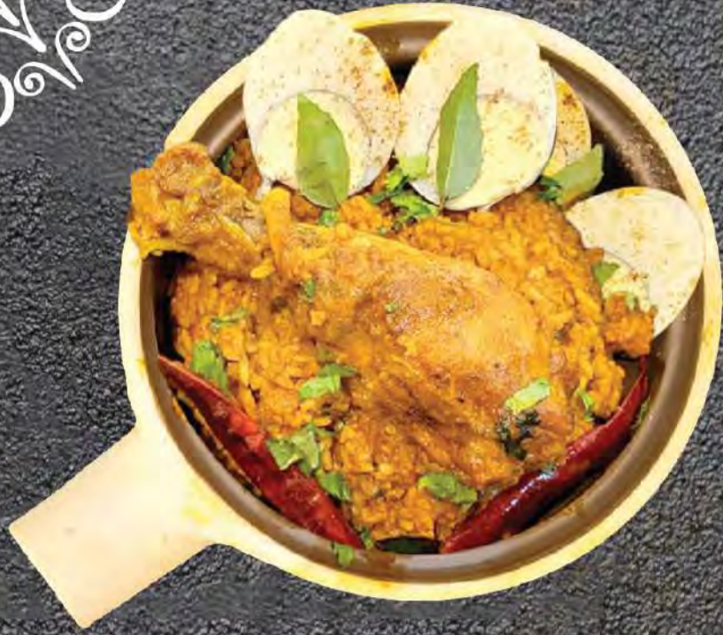
Chicken Satti Sorru

All Pictures shown are for illustration purpose only