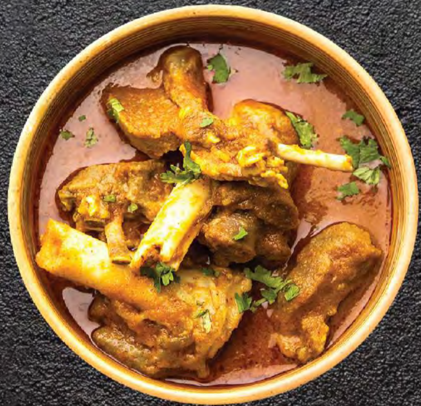
Mutton Rogan Josh