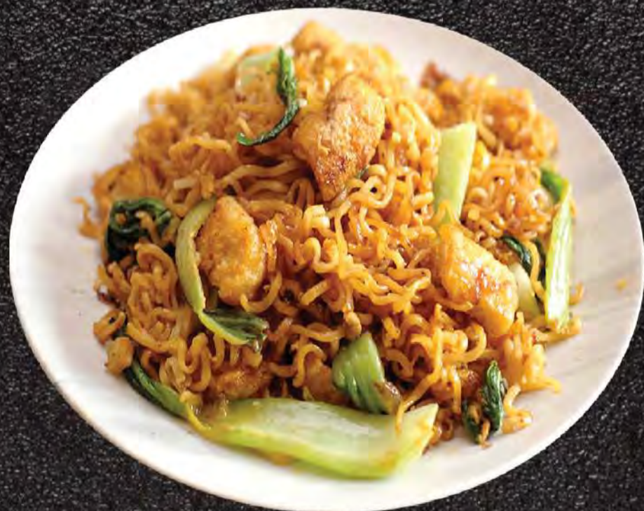
Maggi Goreng Vegetable