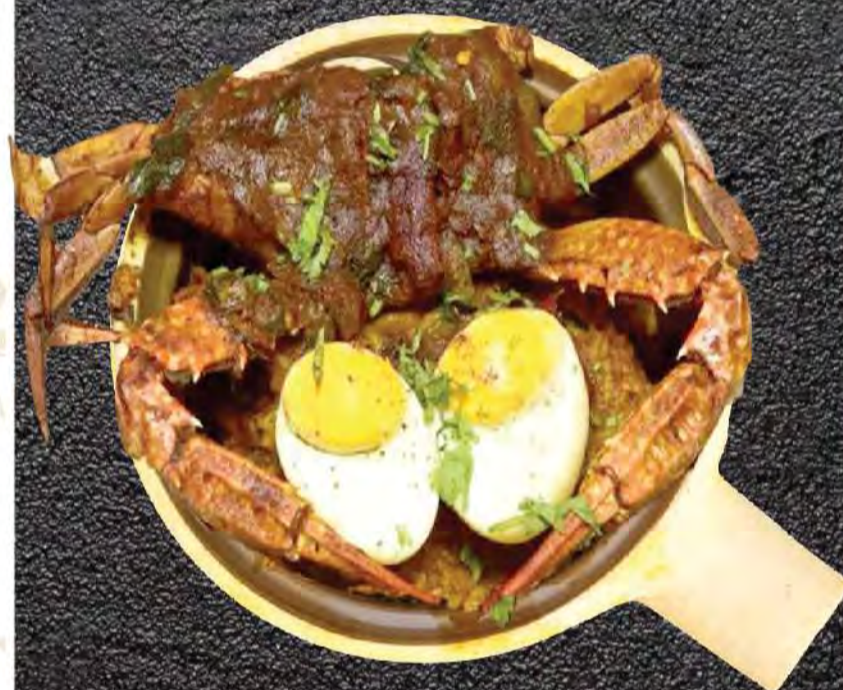
Crab Satti Sorru