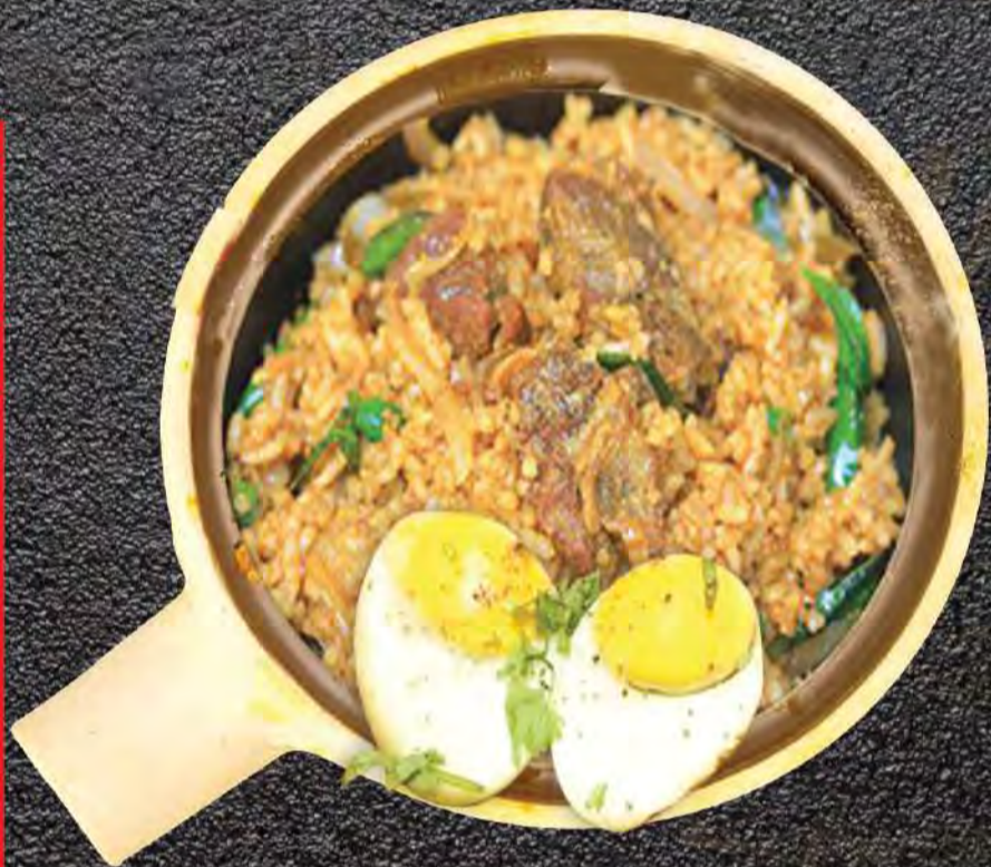
Mutton Satti Sorru