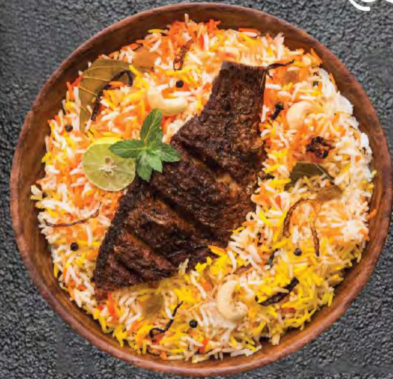
Garlic Fish Biryani

10 % Service Charge applicable + Tax for Dining