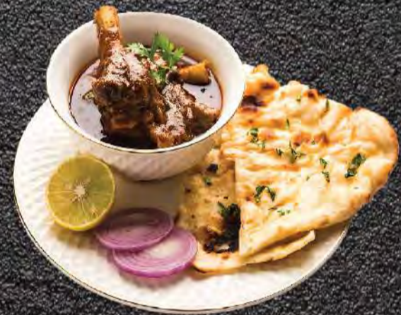
Mutton Rogan Josh with Naan