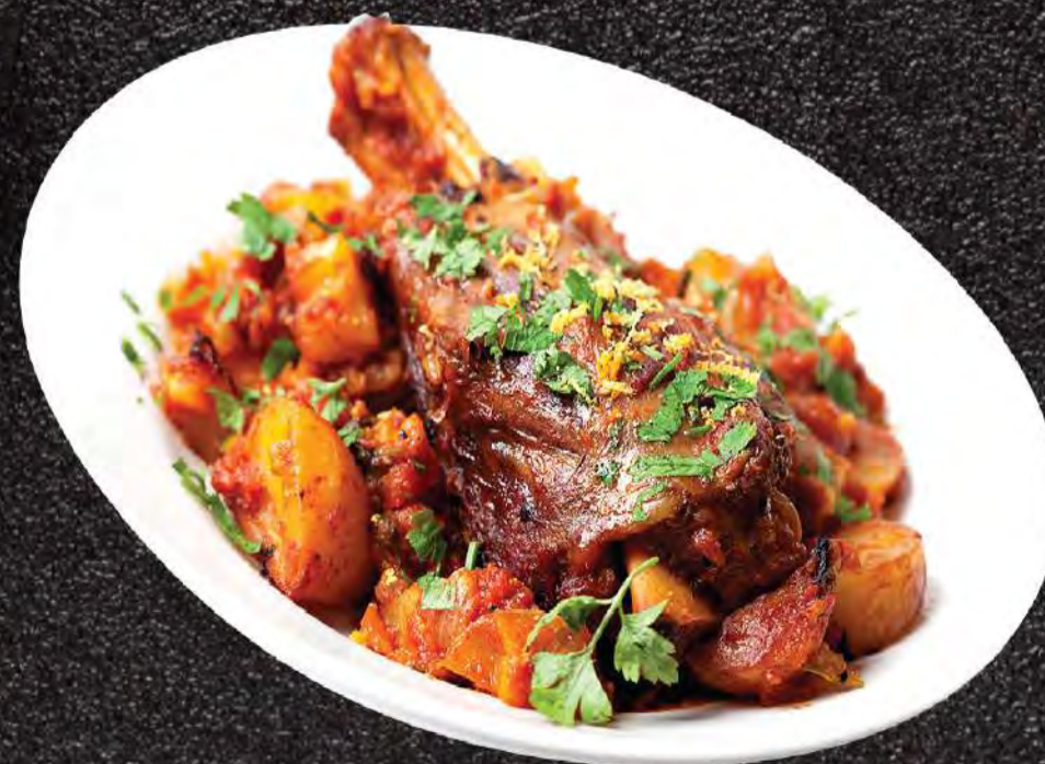
Lamb Shank Varuval

10% Service Charge applicable + Tax for Dining