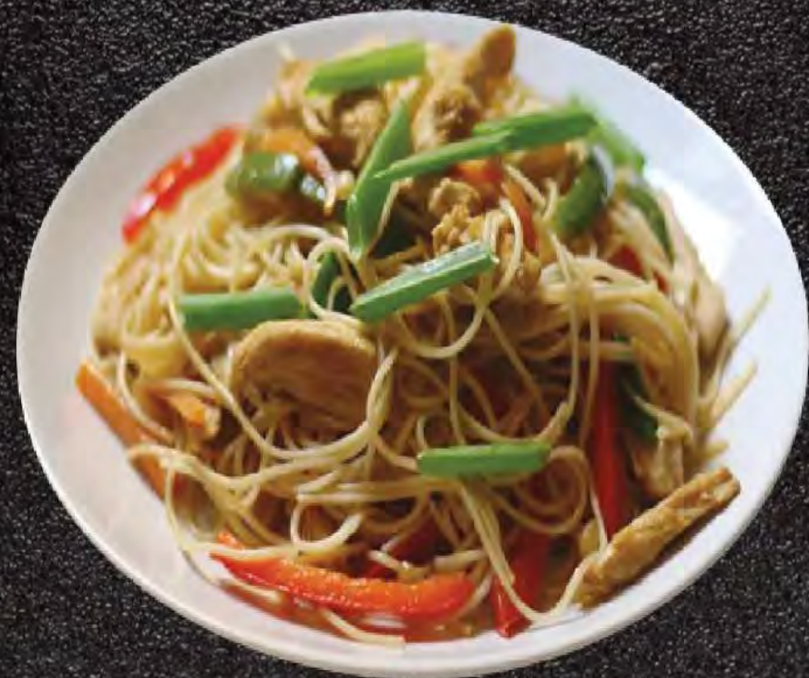
Chicken Hakka Noodles

All Pictures shown are for illustration purpose only