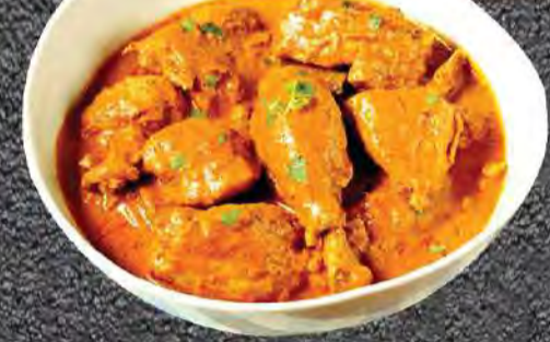
Chicken Korma with Garlic Naan