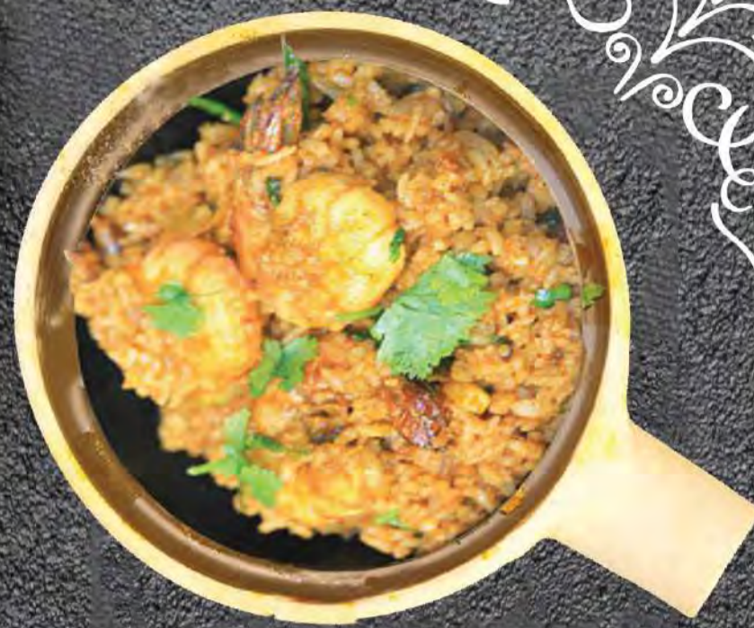
Prawn Satti Sorru