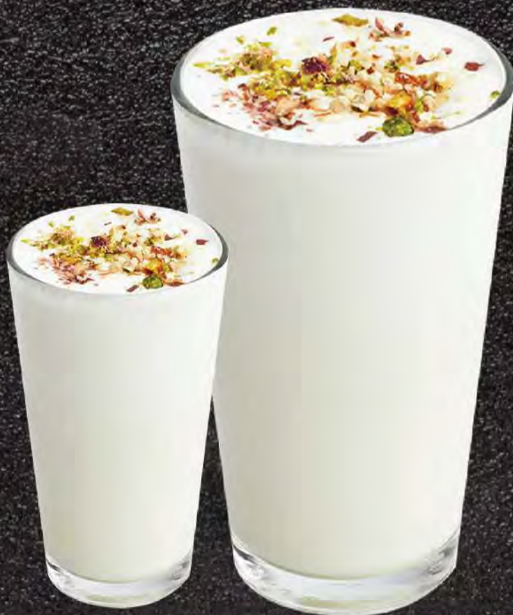
Lassi Sweet / Salt