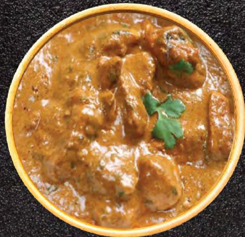
Mutton Curry Masala

10% Service Charge applicable + Tax for Dining