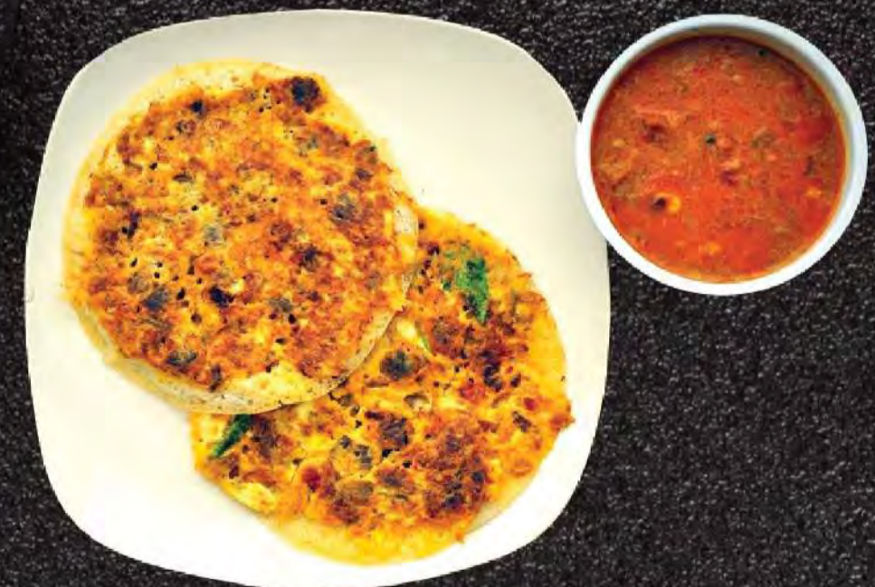
Mutton Dosa Curry

10 % Service Charge applicable + Tax for Dining