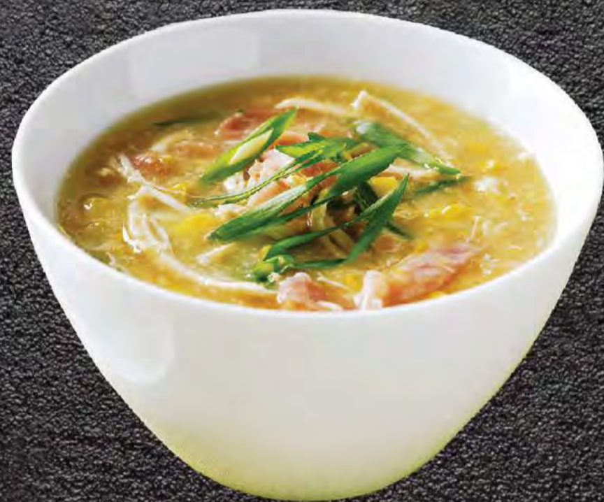
Sweet Corn Chicken Soup