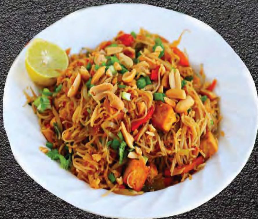
Bee Hoon Goreng Veg