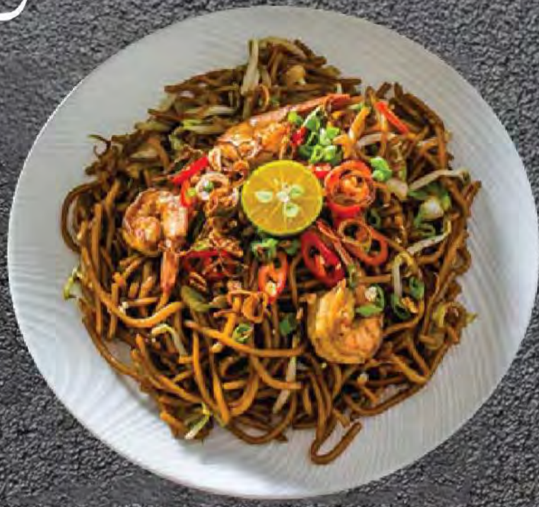
Nasi/Mee Goreng Prawn