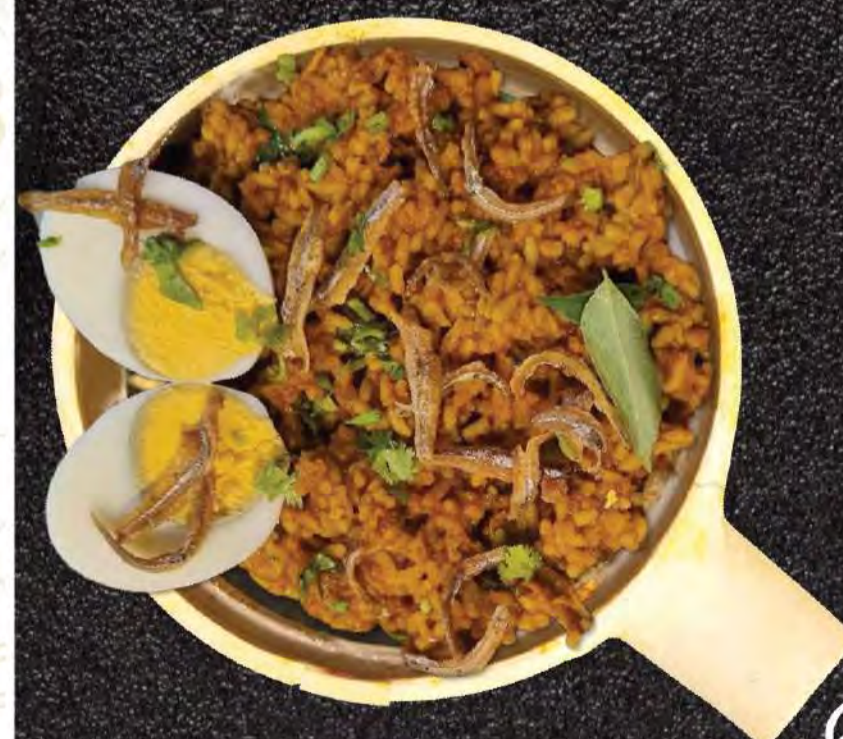
Fish Sambal Satti Sorru

10 % Service Charge applicable + Tax for Dining