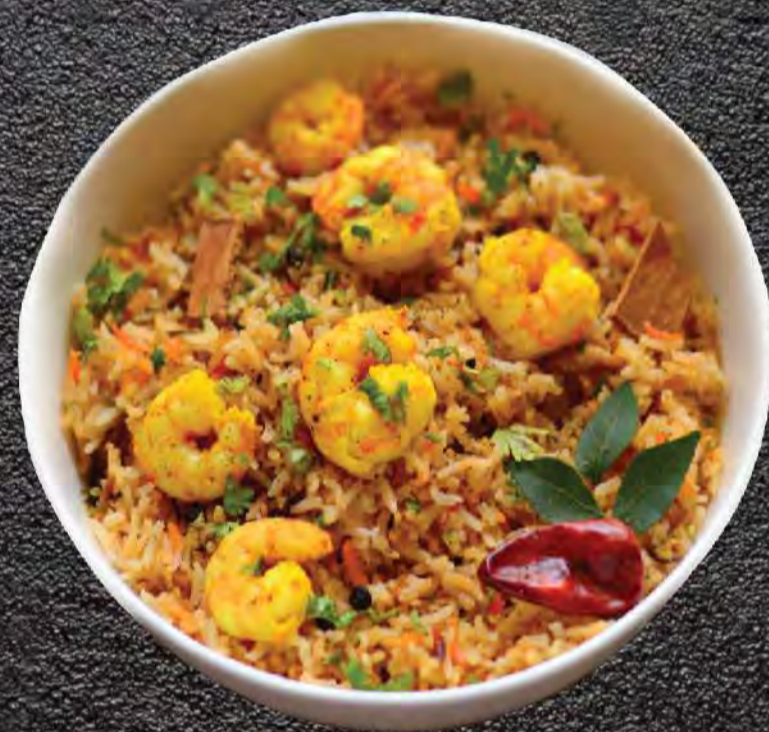
Prawn Mughlai Biryani