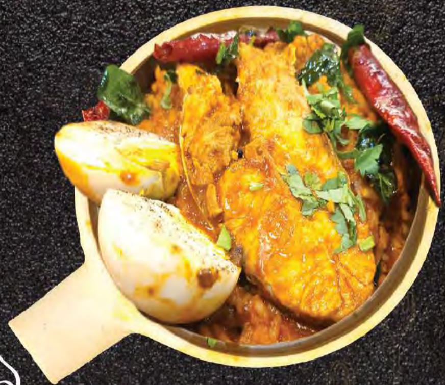
Fish Satti Sorru