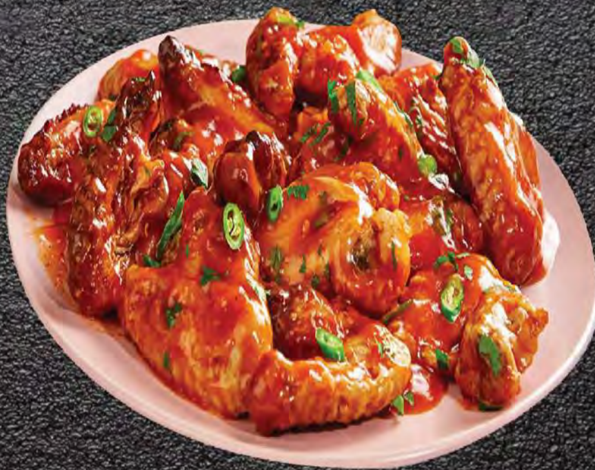
Chicken wings Hot Garlic Sauce